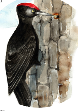
Black Woodpecker Dryocopus martius

Eat packed lunches and using disposable barbecues, provided that you take your waste home with you. You may not build a fire or pitch a tent.